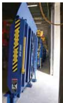
Easy clean pit