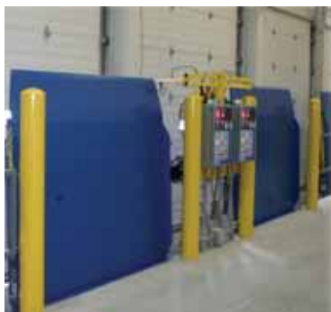
Shown with barrier protection

Blue Giant dock levelers are designed and built to withstand years of rugged use with minimal maintenance while still providing easy, dependable, and safe operation. They have been proven on thousands of loading docks around the world under the most demanding conditions.