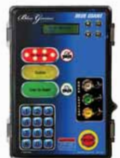
Blue Genius™ Controls