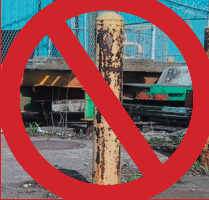
Clean It Up