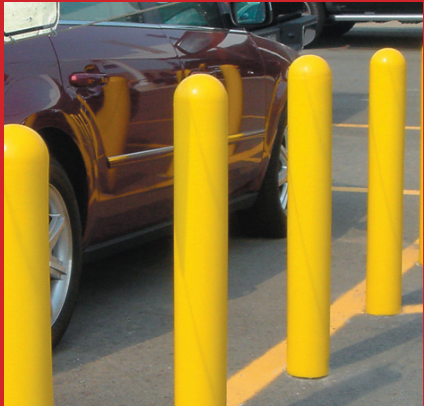
Highly Visible in OSHA Yellow