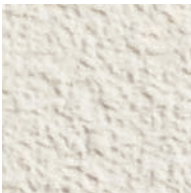
White Embossed Stucco Finish