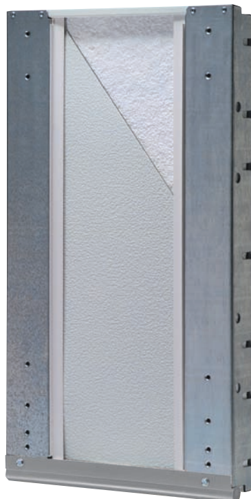
Optional polystyrene insulation sealed between door panel and embossed steel backing cuts heating/cooling cost.

Contact Wayne-Dalton for additional sizes and colors.