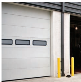
Insulated Lites allow for visibility while maintaining security