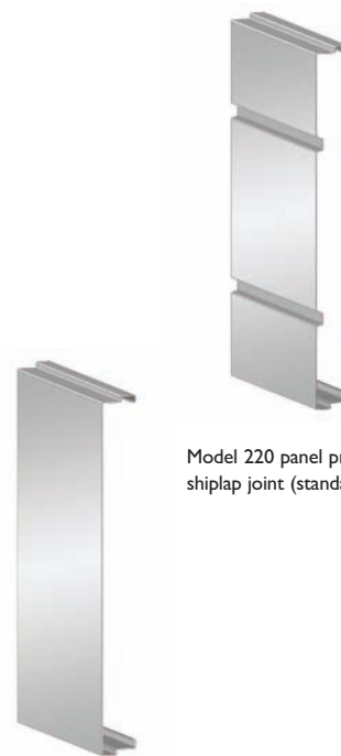
Model 220 panel profile with shiplap joint (standard).